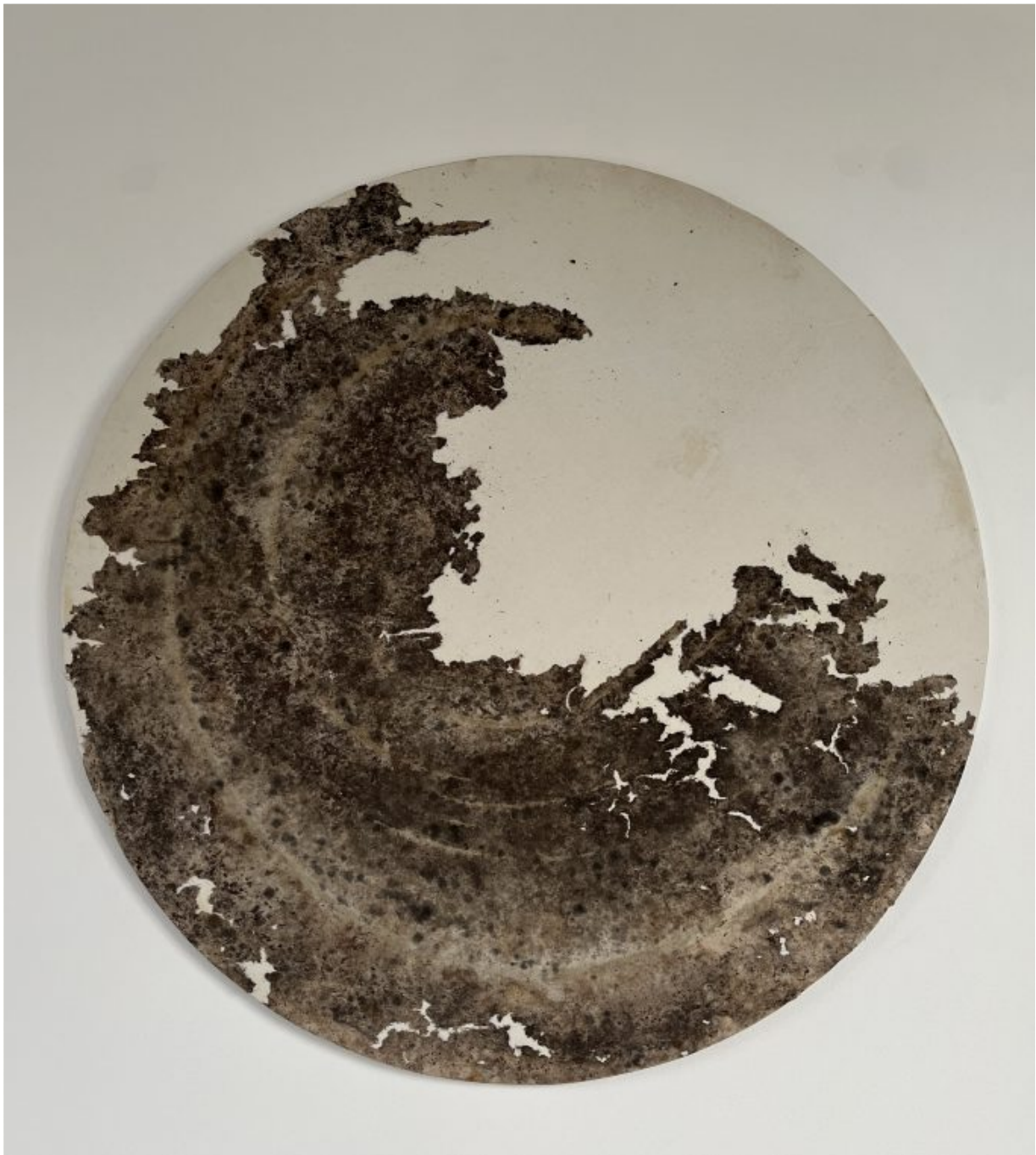
Clément Borderie, canvas produced by the matrix Cuve in Hôpital Charles-Foix in Ivry sur Seine, 7 500€

The way Borderie works is totally natural: he installs a canvas on a metallic structure which he calls a matrix. It can have different shapes. The cloth is covered with successive layers of micro particles which eventually represent time spent. "They reproduce the mysterious writing of nature". The effect is very strong and the colors completely organic. The first room of the Fondation Francès shows a large installation of ceramics by Cat Loray with a protuberant canvas "Iris", by her husband, produced on the well of a garden of the old hospital chapel in Belle-Ile-en-mer. The alliance of the two is spectacular.