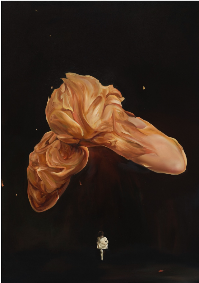
Oda Jaune Brown Night , 2015 Oil on canvas 140 x 100 cm